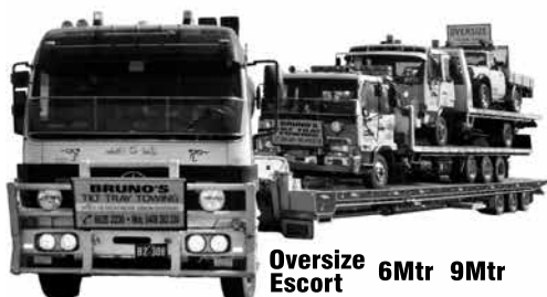
Oversize Escort 6Mtr 9Mtr

• Tractors hire • 12Mtr & 6Mtr Container hire - Buy - Transport • Farm equipment