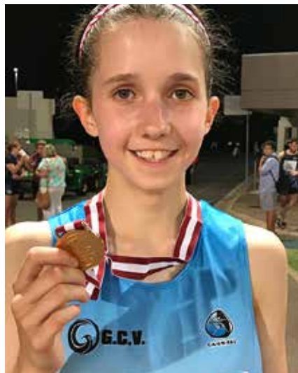
YOUTH SPORTS NEWS p5