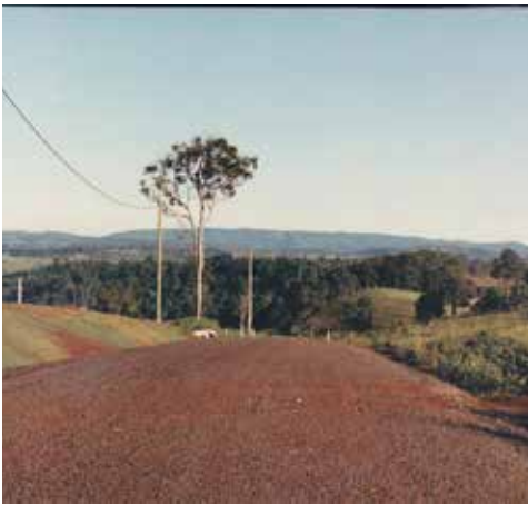
Looking down to the end of Sunny Valley Place

The house directly in front (with the brown tiled roof) was built in the 1980's and the block of land directly to its right was built on about 1988 (from memory).