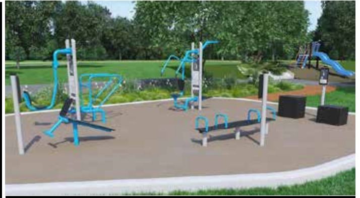
BALZER PARK PLAYGROUND AND FITNESS PARK p7