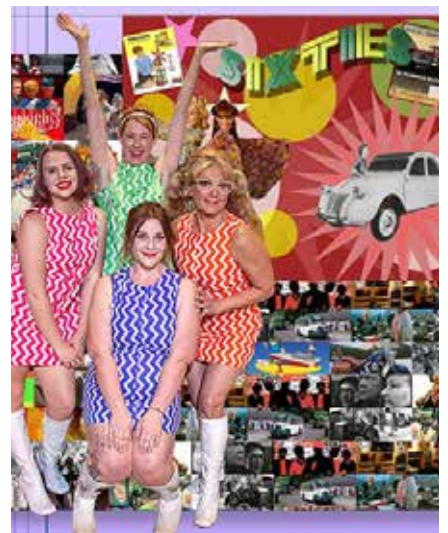
ARTS SPORTS & EVENTS p8-9