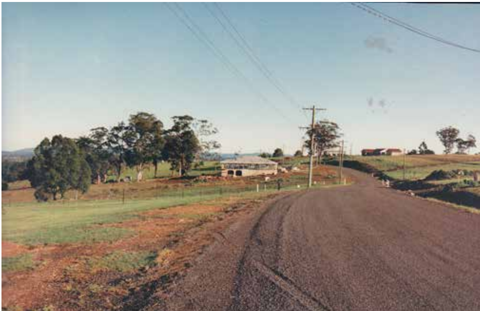
Looking up Funnell Drive