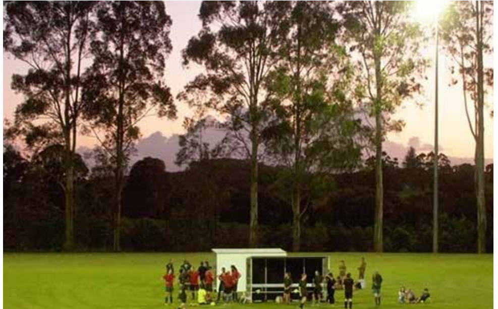
Social 6s at our beautiful grounds at Balzer Park

Social 6s will again be run by the Dunoon Sports Club and this year in partnership with an exciting new sponsor. The event aims to provide fun and fitness for the Dunoon Community through social football (soccer). It