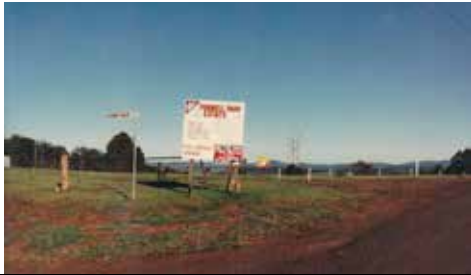
Corner Funnell Drive and Sunny Valley Place

It was in early 1990 that other parts of Modanville were opened up, but only up to Barry's Road. It was sometime in 1991 that the second part of Modanville was opened up.