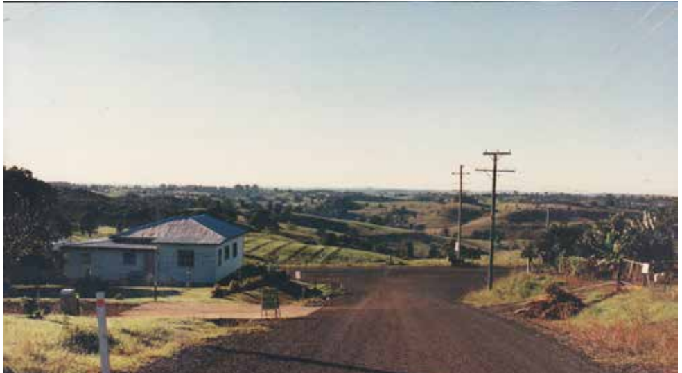
Looking down Funnell Drive. The house on the left was eventually removed.

Yes, I have seen a lot of changes over the years and even more so when Modanville East was opened up sometime in the late 1990's.