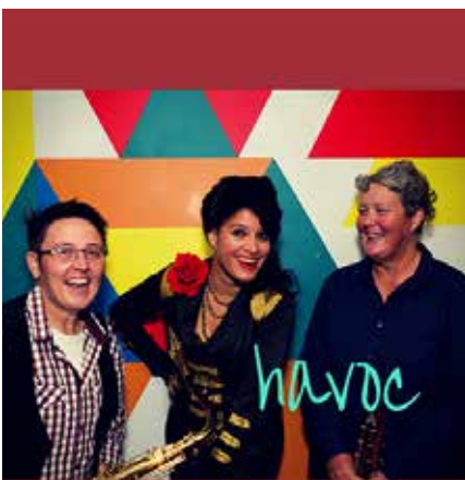
SPORTS CLUB NEWS p12-13