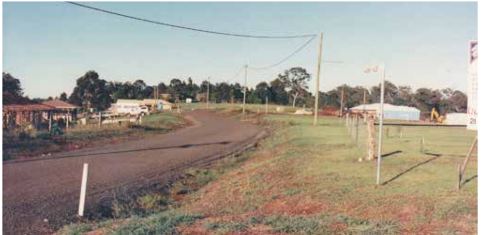
Looking down Sunny Valley Place