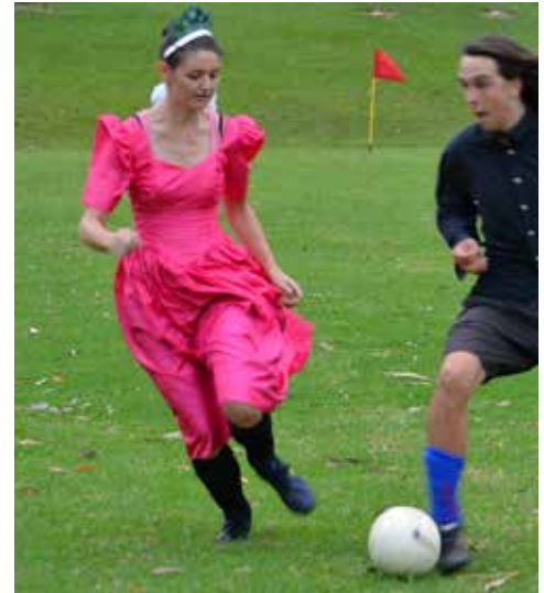
Social 6s Fundraising Event

Visit the Dunoon United Football Club website or like the facebook page to find out more about the upcoming events.