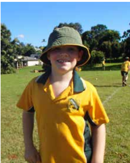
SCHOOL NEWS p4, 6 & 11