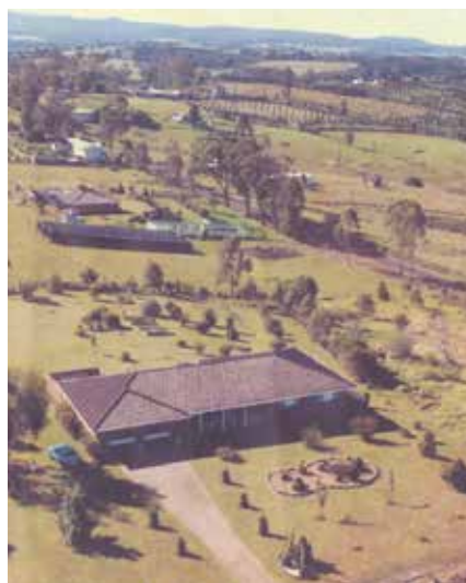
MODANVILLE MEMORIES p14