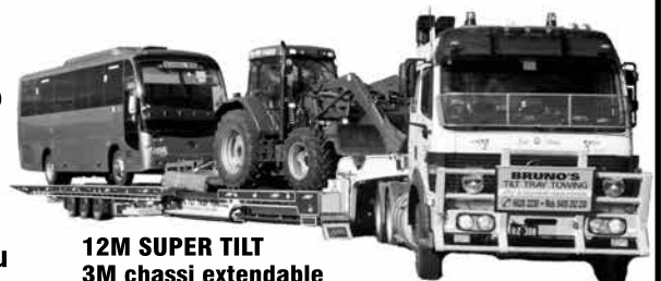
12M SUPER TILT 3M chassi extendable

Modanville 2480 brunozambelli@bigpond.com.au