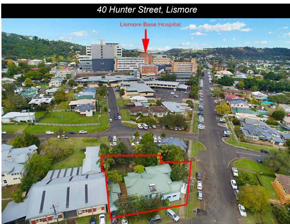
40 Hunter Street, Lismore