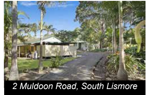
2 Muldoon Road, South Lismore