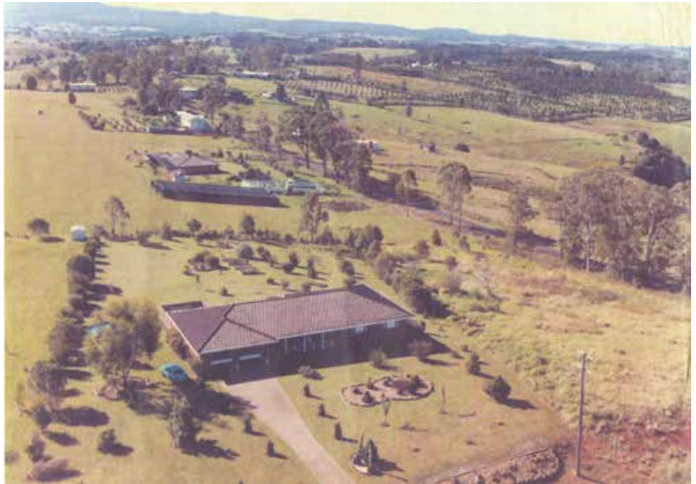
A rare aerial photo taken of Modanville in the early 1980's

As you can see there is no Modanville store and no actual roads through the properties. The property with the long dark shed and smaller white sheds were used by Lloyd for growing various plants. That is now our property, which we bought from Lloyd in September 1990. There were no