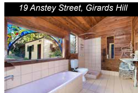
19 Anstey Street, Girards Hill