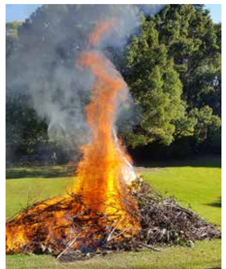
RURAL FIRE SERVICE p16