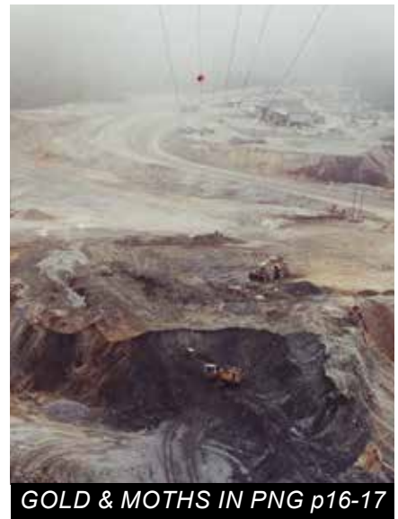
GOLD & MOTHS IN PNG p16-17