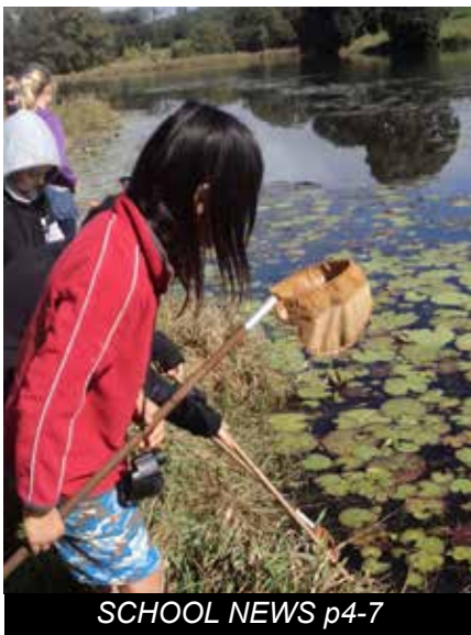
SCHOOL NEWS p4-7