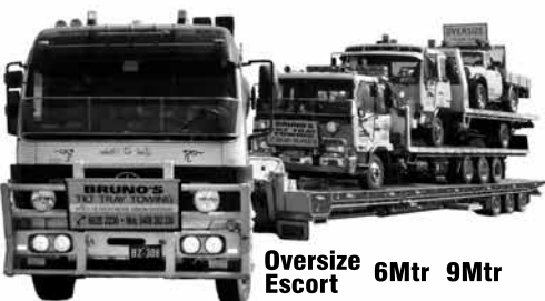
Oversize Escort 6Mtr 9Mtr

Ph: 6628 2230 M: 0428 282 230 Fax: 6628 2676