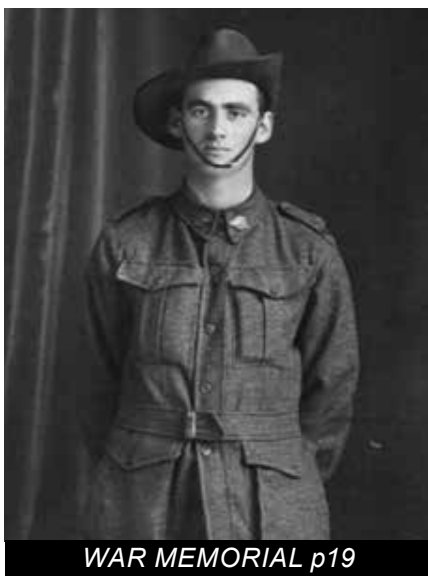
WAR MEMORIAL p19