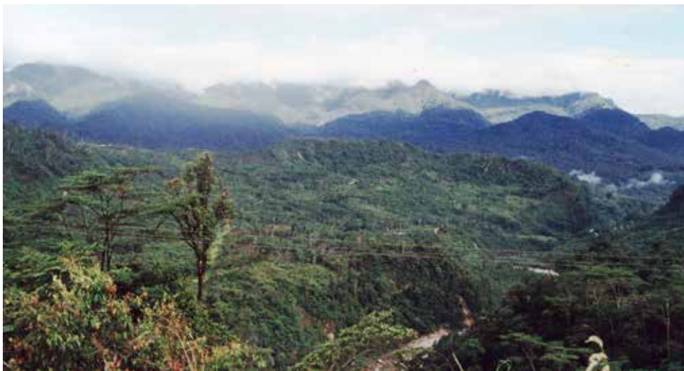
View from road up to the Ok Tedi mine, with the Ok Tedi River seen in bottom of photo (4 February 2001).

In February 2001 I visited the giant gold mining operations at Ok Tedi which is 35km up from the main township of Tabubil. The drive up to the mine site is very "hairy" to say the least because of the many twists and turns in the road to get to the mine site itself. Like all mine sites they are working 24 hours a day. The Ok Tedi site is only 15km from the PNG /Indonesia border.