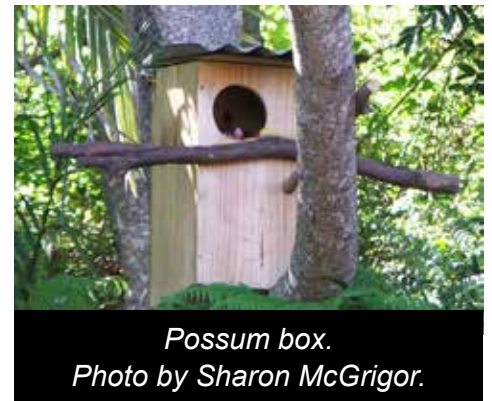
Possum box. Photo by Sharon McGrigor.

Birdlife Australia – http://www.birdlife.org.au/images/uploads/education_sheets/INFO-Nestbox-technical.pdf