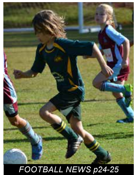
FOOTBALL NEWS p24-25