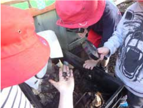
Exploring the worm farm.

The preschool children got into exploring the worm farm creatures in the last week of term... it's like an