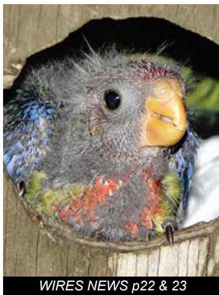
WIRES NEWS p22 & 23