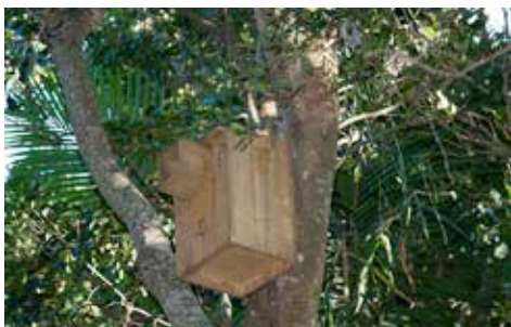
Boobook nest box.

Wildlife Queensland – http://wildlife.org.au/wp-content/uploads/2015/11/nestbox_instructions.pdf