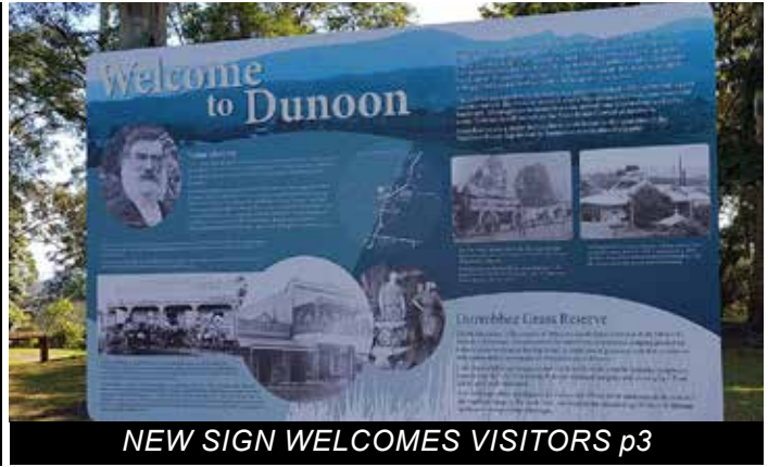
NEW SIGN WELCOMES VISITORS p3