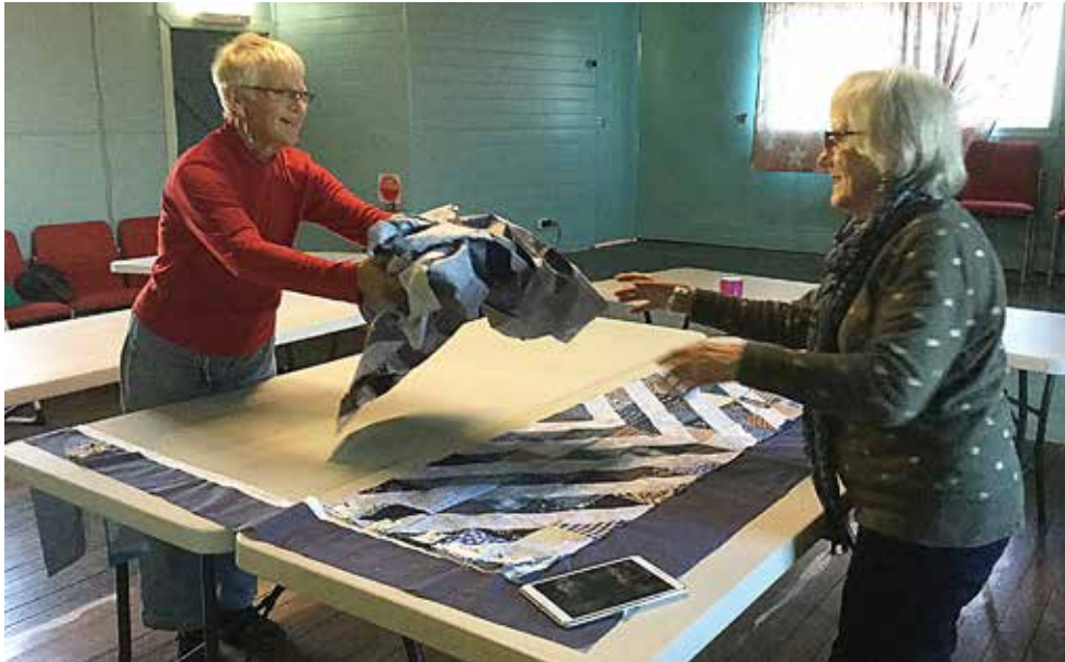
Preparing the raffle quilt for the exhibition.

On Saturday 15 September Dunoon Hall will be decked out with a display of beautiful craftsmanship from the women of this very talented local sewing group. This will be our second show, after the first highly successful one almost two years ago, so if you missed it then, you have another opportunity.