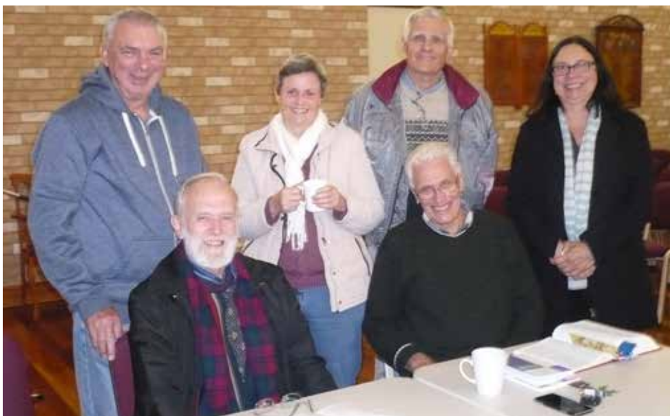
Bible study group.