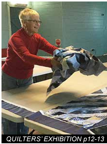
QUILTERS' EXHIBITION p12-13