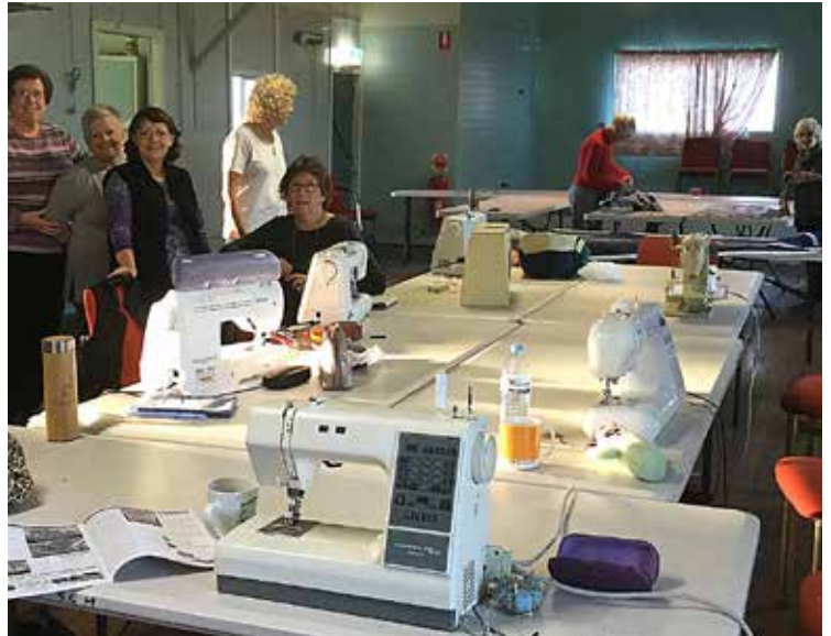
Quilters' group members enjoying the social aspects of the gathering, and hard at work.