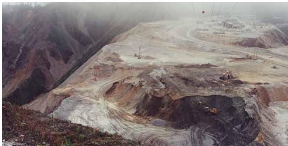
Another section of the Ok Tedi gold mine in 2001.

In 1958 a team of geologists were looking for any signs of gold deposits