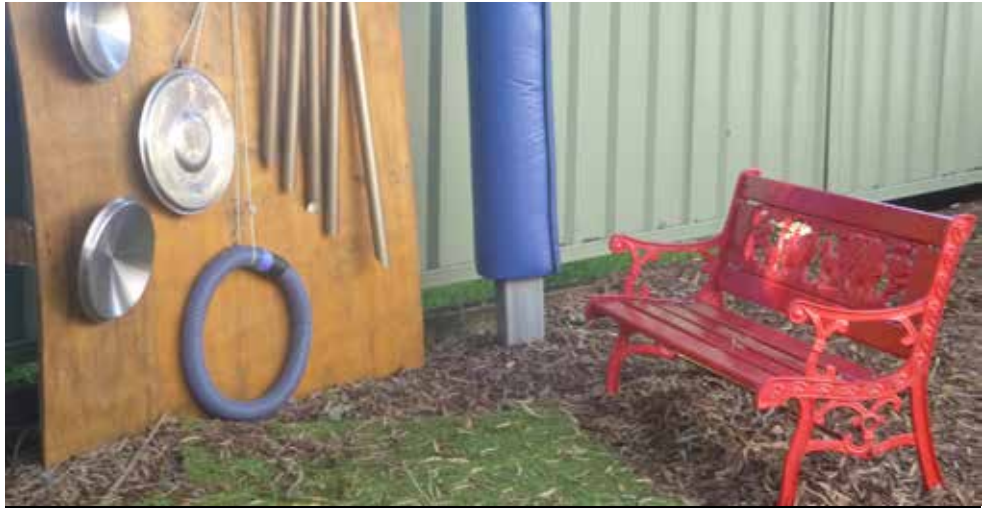
Thank you Men's Shed for our garden seat!

insect hotel in there! We are compiling a photo record of all the creatures we can find at preschool.