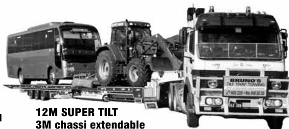
12M SUPER TILT 3M chassi extendable

Modanville 2480 brunozebellei@bigpond.com.au