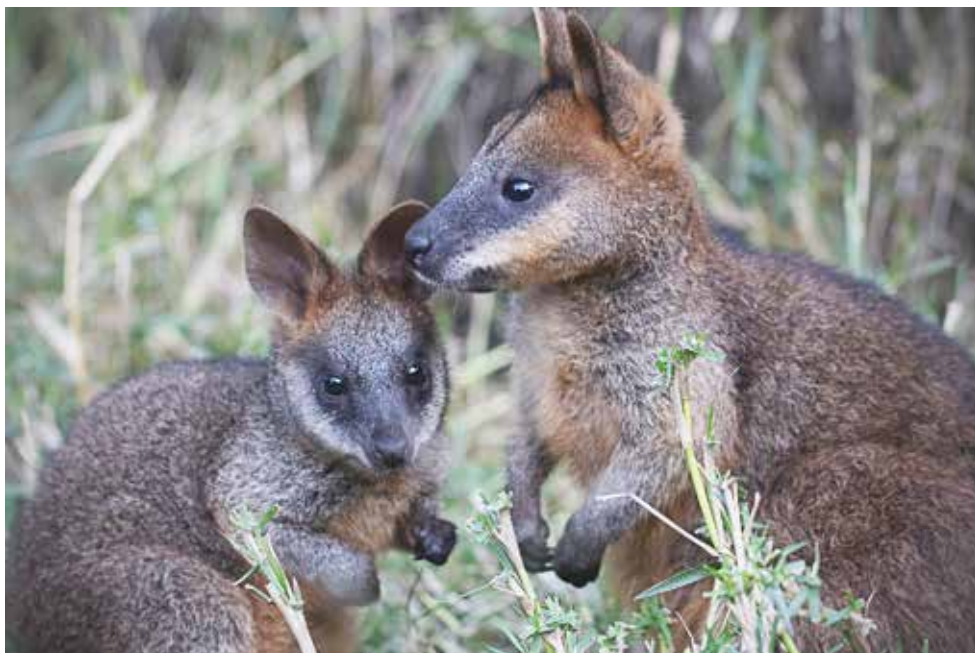
Atlas (the joey) on the right, with Isla (left).

As it transpired, a dead wallaby had been seen some four or five days beforehand on the periphery of the caller's property. Their dog, a Belgian shepard named Atlas, had been seen sniffing at the body days before, but it was assumed the wallaby was long dead and no one went to check.