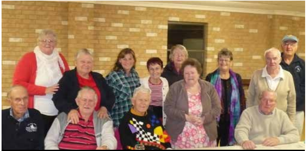
Card players in the undercroft.

On 3 June we had a 'Biggest Morning Tea' run by some of our congregation who had recently been on a weekend Cursillo training. They shared with us all the lasting impact of that training on their faith journeys. Similar morning teas were held in Lismore and a great deal of money was raised for Cancer Council Australia.