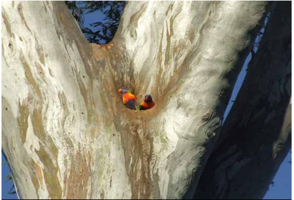
Parrots in hollow.