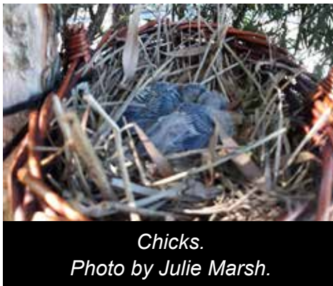
Chicks.