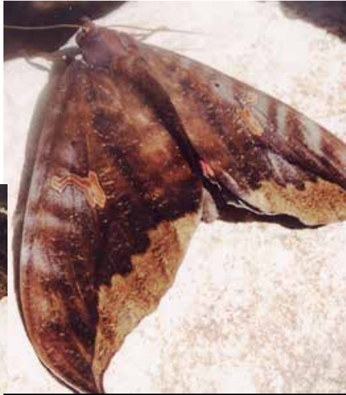
Above: A large moth of Tabubil. Left: Underside of moth.